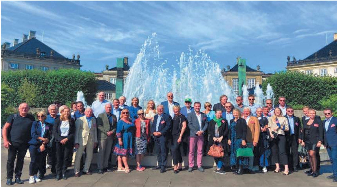
Copenhagen Goodwill Ambassadors 25th Anniversary

Every August, the Goodwill Ambassadors gathered in Copenhagen for the Annual Meeting. The Goodwill Ambassadors were invited home for a three-day seminar, in which they were updated on the latest news, strategies, and priorities from Greater Copenhagen and met with relevant actors and stakeholders from Copenhagen.