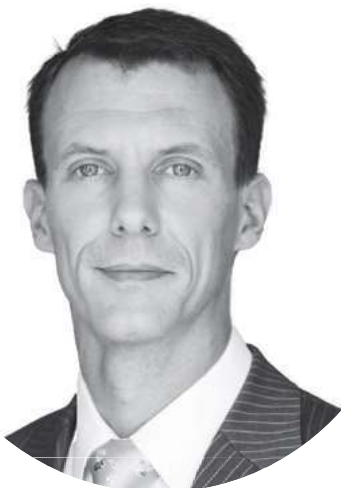
HRH Prince Joachim of Denmark Patron of Copenhagen Goodwill Ambassadors

I hope you will have a wonderful 25-year Anniversary.